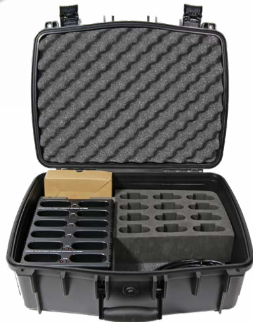
CHG 3512 PRO